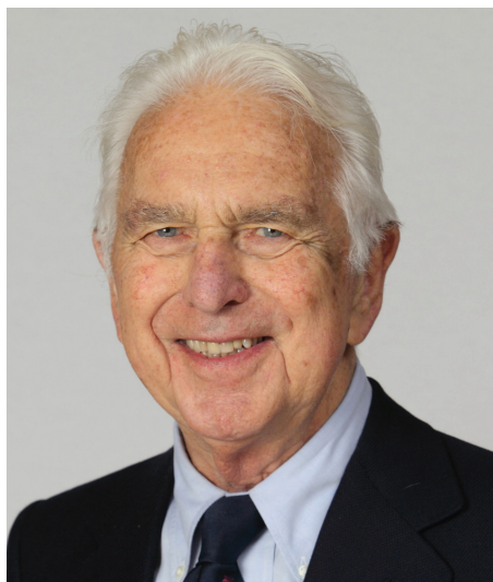
Warren G. Bennis in 2012.