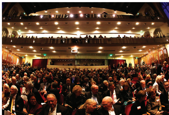
Bovard Auditorium was filled to capacity. The far-ranging conversation touched on everything from the Bushes' time in the White House to their continued humanitarian work in Africa.