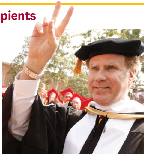
USC alumnus Will Ferrell is a renowned actor and comedian, known for his roles in Elf and Anchorman , as well as his work on Saturday Night Live .