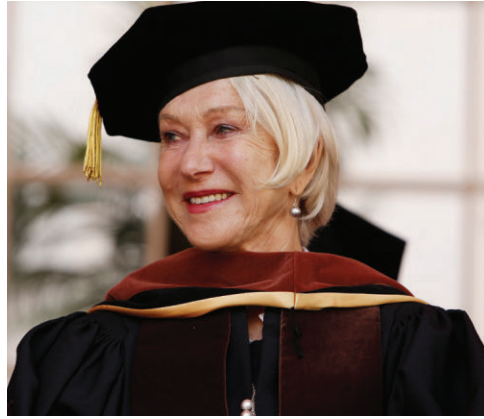
Dame Helen Mirren won an Oscar for her work in The Queen , and two Emmys for her portrayal of the steel-nerved police detective on Prime Suspect .