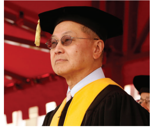
Time magazine's Man of the Year in 1996, David Ho is an acclaimed scientist and medical researcher, known for standing at the fore of HIV/AIDS research.